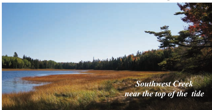
Southwest Creek near the top of the tide